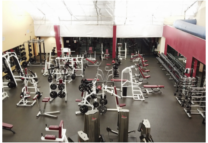
While saving energy with 300W high-CRI TK1 LED high bays, Sportsplex's interior colors can now pop, giving customers a more lively experience.