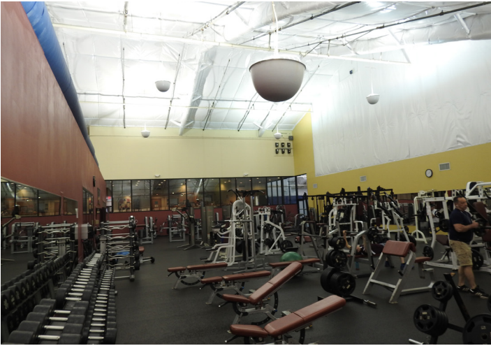
Despite the bright interior walls, Sportsplex's 1080W metal halide fixtures provided dim illumination resulting in a drab atmosphere.