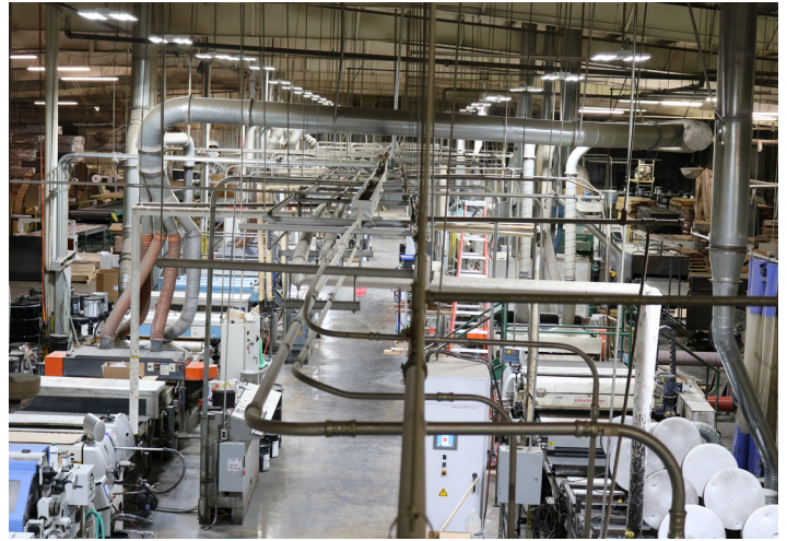
Premiere Finishing and Coating's machines are now sharply illuminated by Big Shine's Oriya linear high bays, allowing employees to accurately see the color of the wood stains to better service their customers.