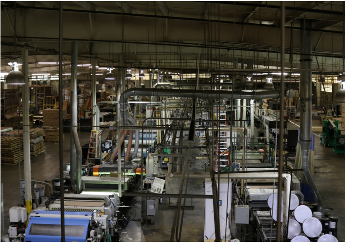
The metal halides mounted above machinery in Premiere Finishing and Coating's plant were dim, increasing the danger of eye-strain and error due to inaccurate color rendering.