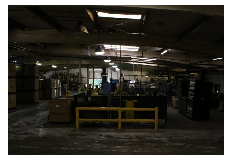
The low lighting conditions at Plastic Products of the South caused safety concerns for employees. IES recommends having at least 50 foot-candles to accomplish work efficiently and safely.