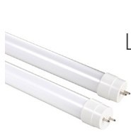
T8 4ft LED Tube