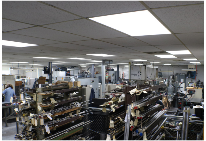
Not only do Big Shine's panels provide enough light, but they also provide a cost-saving, energy-efficient solution.