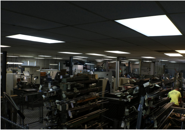
Prior to the LED upgrade, Peerless Precisions workspace was too dim to allow employees to work at their full potential.