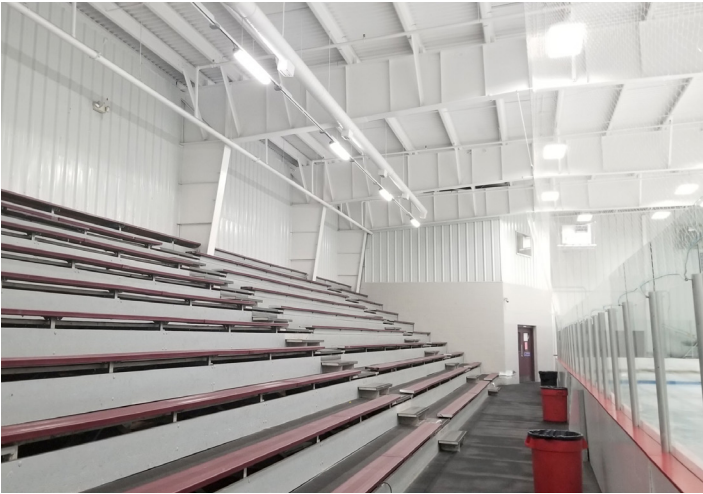
Big Shine LED's bright, white lights contribute to the clean environment of Burbank Ice Arena. Virtually maintenance-free, the new lighting arrangement allows management to focus on the rink and its activities.