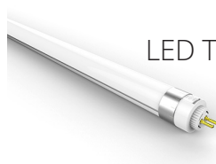
T5 LED Tube